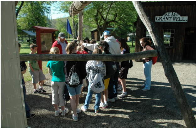
A volunteer guide demonstrates the inter-active spring pole exhibit during annual May school tours

Friends of Drake Well, Inc. publishes a quarterly newsletter, called The Barker , which keeps members informed about events, recent acquisitions, and programs at Drake Well. Friends also publishes the award winning Oilfield Journal , an annual collection of articles and research about oil industry history.